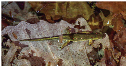
An Eastern Newt swims among delicate Fairy Shrimp.

Dan Hyde, founder of the Lewisburg Photography Club, hurried to the Lycoming Co. property to record—under challenging conditions—the mating activity in the site’s vernal pools.