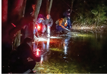
Spectators scan the intense amphibian activity in a vernal pool and capture it with their smart phones.

During the evening of March 6, at Glacier Pools Preserve, the temperature rose to 40 degrees Fahrenheit and remained there throughout the evening. For thousands of salamanders and frogs that was the cue conditions were just right for their annual mating ritual. Communications went out from Conservancy Adventure Coordinator Becky Stugart to those who wanted to observe this epic natural phenomenon.