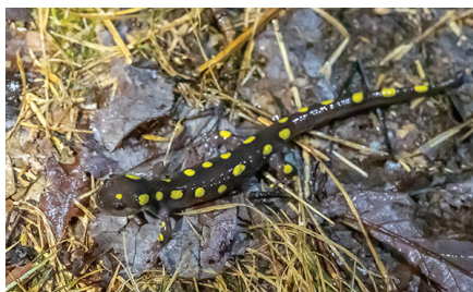
A photogenic Spotted Salamander was found on a trail.

The Salamander Spawning event is one example of the exciting programs available this year. There are many more to come. The following events are scheduled through July. Go to our website at https://linnconservancy.org/news/ for information about programs slated through the winter Solstice in late December 2024.