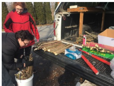
Volunteers prep live stakes to be embedded in stream banks.

The Linn Conservancy has recently partnered with Susquehanna University, Chesapeake Conservancy, and PA DCNR to start a live stake collaborative—a pilot project beginning here in the valley at Susquehanna University. Live stakes are living shrub and tree branches that root readily when