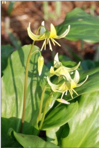
Erythronium (trout lily)