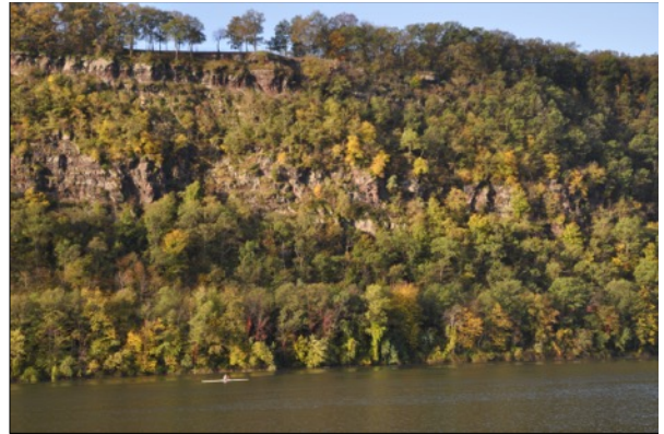
A kayaker paddles past Shikellamy Bluffs as seen from Northumberland.