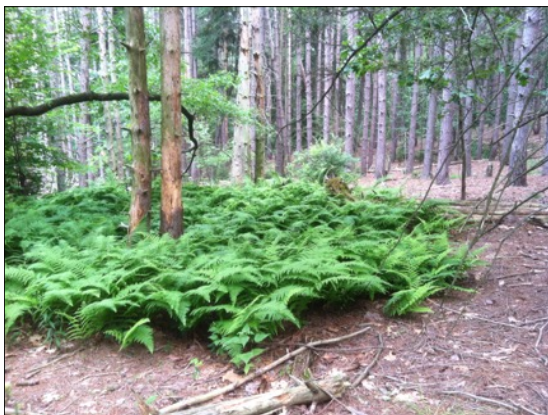
A stand of ferns in Shikellamy Bluffs